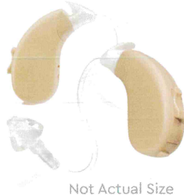
Not Actual Size